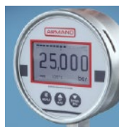
Electronic Pressure Measurement