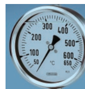
Mechanical Temperature Measurement