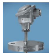
Electrical Temperature Measurement