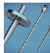
Thermowells & Accessories