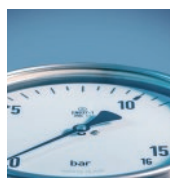
Mechanical Pressure Measurement